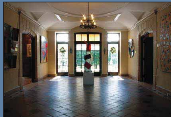
I.E. Millstone Grand Hall

Discounts on exhibit entry fees Discounts for art classes & workshops 10% Gift Shop discount 10% Art Mart discount 15% Dick Blick discount Use of Printmaking Studio discount Newsletter subscription Listing in membership directory