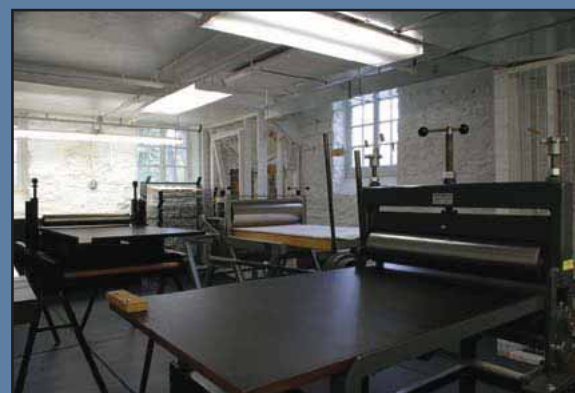
Printmaking studio available for artist rental, classes or workshops